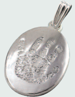
OVAL W/ FOOTPRINT/HANDPRINT*