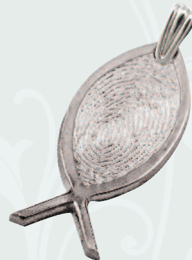
ICHTHUS (JESUS FISH)*