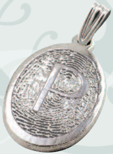
RINGED OVAL WITH INITIAL*