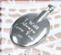
Example Custom Engraving

308 Solid Sterling Silver; Bronze or Sterling Silver Inlay