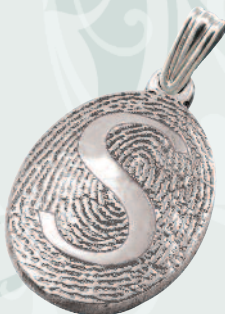
OVAL WITH INITIAL*