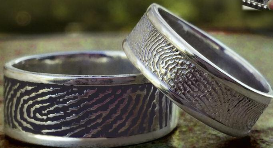
32-408 8mm shown in Style A with Antique Finish.